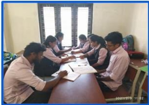
A classroom Discussion