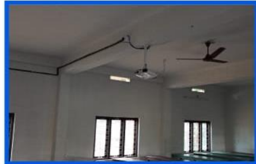
ICT enabled classroom